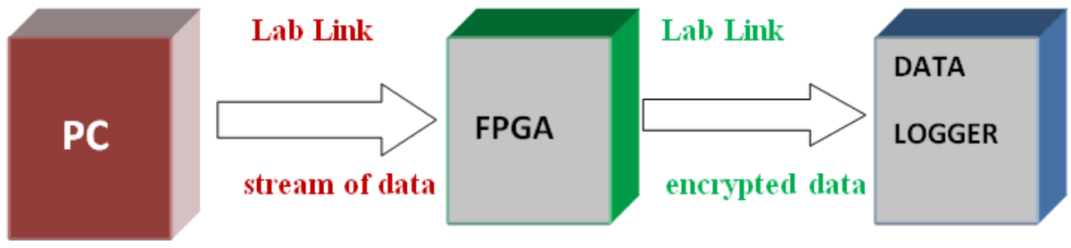
Figure (1) Block diagram of the encyption system

The aim of the design is to illustrate the usage of the encryption process and its applications .The electronic devices required to construct the encryption system is a personnel computer, FPGA, data logger, plus interconnection links and lab link cable. The block diagram of the hardware implementation of the entire system is shown in Figure (1) below.